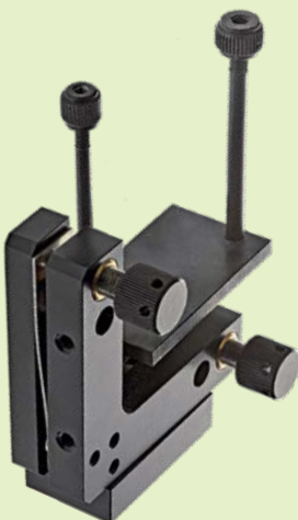
Mount for fine tuning of TK8 crystal ovens angle. The tuning range is \pm 2.5^\circ .