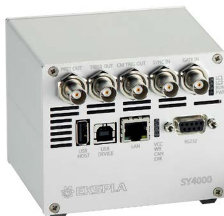
SY4000 Synchronization module and pulse delay generator encased